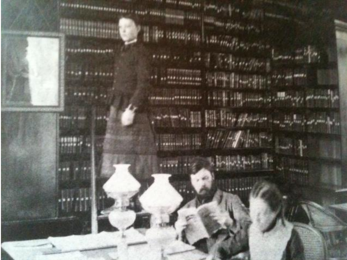
This historical photograph shows the interior of the Rugby Public Library

Coleman points out that, although nothing remains of the second Tabard except the overgrown foundation stones, the slow progress of the fire allowed some of the furniture to be rescued, including the furnishings of room 13. They are now scattered throughout many of Rugby's historic homes, including Newbury House, which is also haunted.