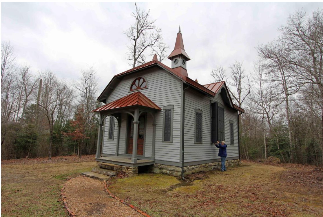
Rugby Public Library as it looks today